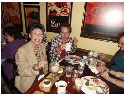
More Yummy Desserts

We welcome all Women’s Connection members at all meetings. Watch for calendar updates in Passages, the Source, E!Minders and Facebook (and don’t forget to Like us!).