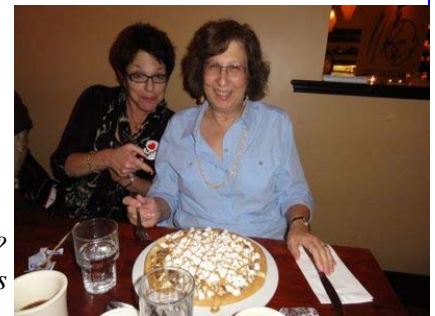
Dessert Anyone? Max Brenner's

Shop 'til you drop at our annual Chanukah Bazaar (10:00 am – 2:00 pm). All of your gift-giving needs under one roof, with more than 40 vendors selling a variety of handmade, custom and unique merchandise to please everyone. There will be plenty of items just right for the holidays, and food will be available for purchase at the M'kor Café.